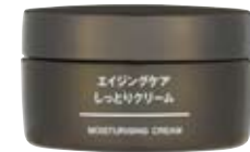
MOISTURIZING CREAM Aging Care