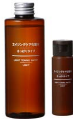
LIGHT TONER Aging Care

6.76 FL OZ (200 ML) $ 22.00 1.69 FL OZ (50 ML) $ 7.50