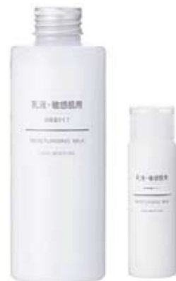
HIGH MOISTURIZING LOTION Sensitive Skin

6.76 FL OZ (200 ML) $ 10.50 1.69 FL OZ (50 ML) $ 4.50