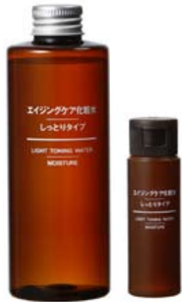
MOISTURIZING TONER Aging Care

5.07 OZ (150 ML) $ 22.00 1.69 FL OZ (50 ML) $ 7.50