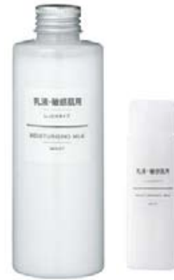
MOISTURIZING LOTION Sensitive Skin

6.76 FL OZ (200 ML) $ 10.50 1.69 FL OZ (50 ML) $ 4.50