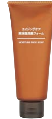
HIGH MOISTURIZING CLEANSING FOAM Aging Care