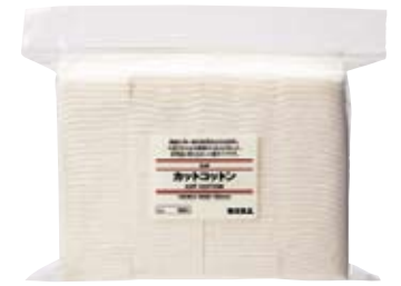
CUT COTTON / ECRU

Zip lock bag keeps them clean. Cotton Pads Size : 2.4 x 2.0" 140 pads