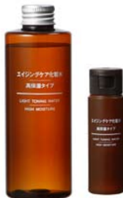
HIGH MOISTURIZING TONER Aging Care

5.07 OZ (150 ML) $ 22.00 1.69 FL OZ (50 ML) $ 7.50