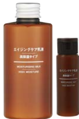
HIGH MOISTURIZING LOTION Aging Care

6.76 FL OZ (200 ML) $ 22.00 1.69 FL OZ (50 ML) $ 7.50