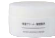
MOISTURIZING CREAM Sensitive Skin