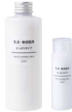
LIGHT LOTION Sensitive Skin

6.76 FL OZ (200 ML) $ 10.50 1.69 FL OZ (50 ML) $ 4.50