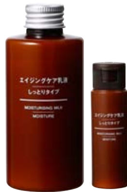
MOISTURIZING LOTION Aging Care

6.76 FL OZ (200 ML) $ 22.00 1.69 FL OZ (50 ML) $ 7.50