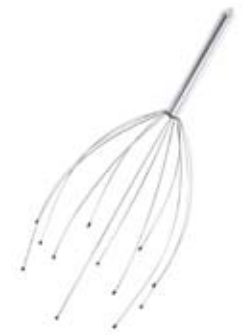
REFRESH HEAD SPA