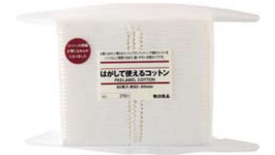
CUT COTTON - LAYERED