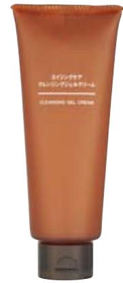
CLEANSING GEL CREAM Aging Care