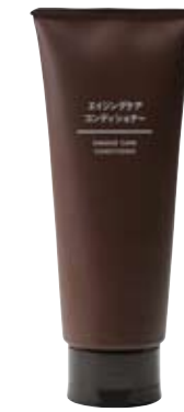
CONDITIONER Damage Care