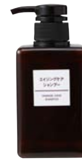
SHAMPOO Damage Care