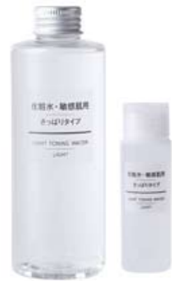
LIGHT TONER Sensitive Skin

ACTIVE INGREDIENTS: GRAPEFRUIT SEED EXTRACT, PURSLANE EXTRACT