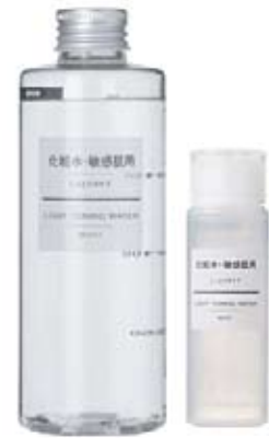
MOISTURIZING TONER Sensitive Skin

6.76 FL OZ (200 ML) $ 10.50 1.69 FL OZ (50 ML) $ 4.50