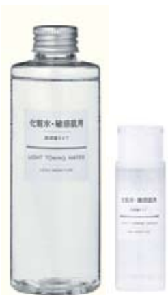
HIGH MOISTURIZING TONER Sensitive Skin

6.76 FL OZ (200 ML) $ 10.50 1.69 FL OZ (50 ML) $ 4.50