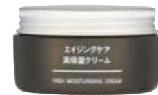
HIGH MOISTURIZING CREAM Aging Care