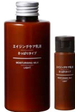
LIGHT MOISTURIZING LOTION Aging Care

6.76 FL OZ (200 ML) $ 22.00 1.69 FL OZ (50 ML) $ 7.50